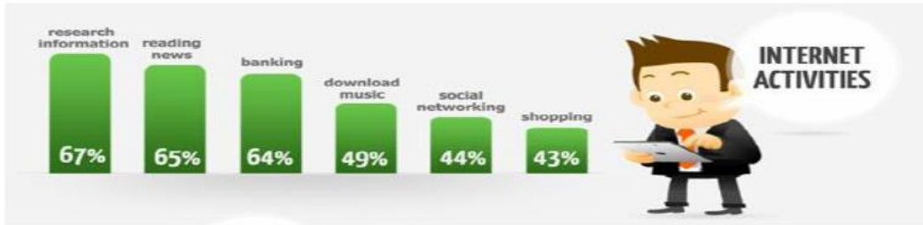
Figure 1: Online shopping in Iran.